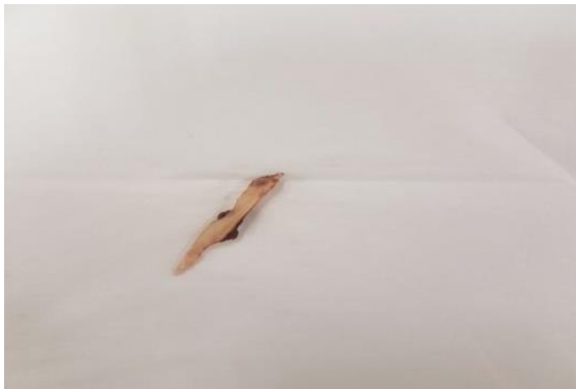
Figure 2. Image of rabbit bone after surgery