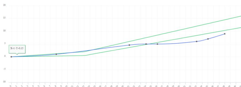
Figure2. Second pregnancy growth chart