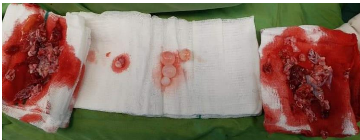
Figure 2. Photographic images of multiple hydatid cysts removed during surgery.