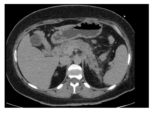
Figure 1. Abdomen computed tomography revealed peri-pancreatic fat with no contusion, exudative changes around the pancreas.

Abdominal computed tomography revealed peripancreatic fat without contusion and exudative changes around the pancreas. There were also no signs of gallbladder, biliary system, or stone abnormalities. Therefore, the patient was diagnosed with acute pancreatitis (Figure 1).