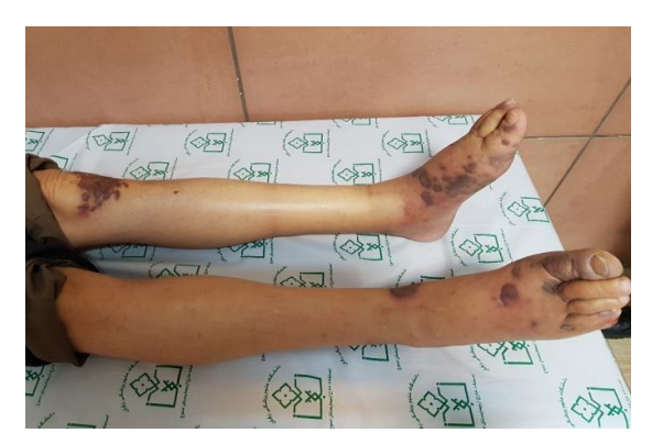
Figure 1. Numerous skin lesions in the two lower extremities.