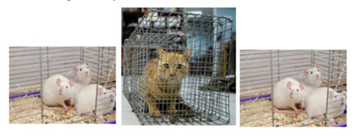
The rats were stressed at 8-9 a.m. and 4-5 p.m, twice daily, 50 days for male and 15 days for female.

The pregnant subjects were transferred to new cages and kept in normal conditions for the entire pregnancy period. The duration of pregnancy was the same, 21 days, in four groups. Upon delivery, the pups were counted, weighed, and gendered. All the litter was culled to eight per dam. The rat pups were allocated according to their own parents' grouping as follows: Both fathers and mothers were control (Mc-Fc); just the mother was stressed (Mc-Fs); just the father was stressed (Ms-Fc); and both the father and mother were stressed (Ms-Fs) (10). There were 64 pups in each group (8 dams \times 8 pups = 64).